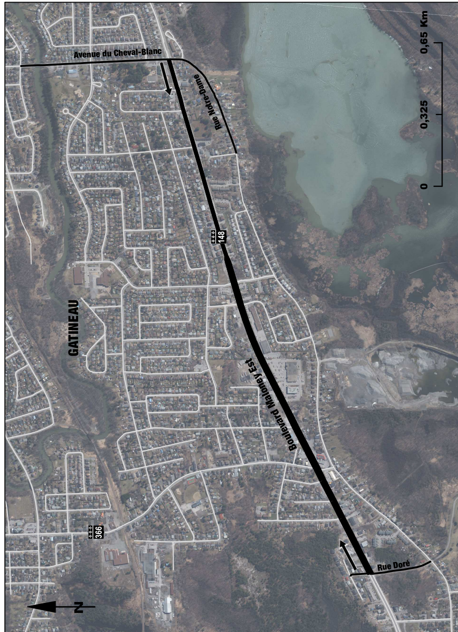
MAP 5-5.3-m-ii IN THE TERRITORY OF VILLE DE GATINEAU, THE PORTION OF ROUTE 148 WHICH EXTENDS FROM ITS INTERSECTION WITH RUE DORÉ TO THE INTERSECTION WITH AVENUE DU CHEVAL-BLANC AND RUE NOTRE-DAME