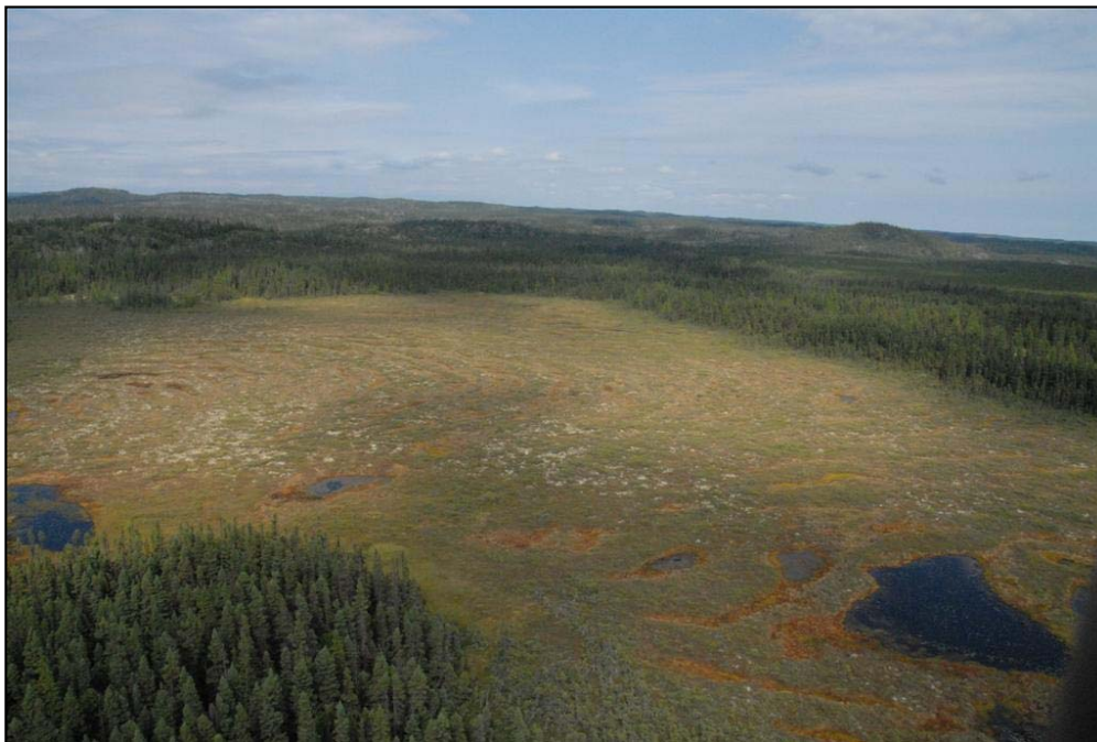
Unusual domed ombrotrophic peat bog located in the Southern part of the reserve.

Wildlife: All typical species of the Boreal environment are likely to be found in the ecological reserve, including otter, fox, muskrat, American black bear, moose and beaver. Woodland caribou, which is an ecotype that has been designated as vulnerable in Québec, is also found here, although sporadically. Atlantic salmon and brook trout are the two typical Côte-Nord river species found in the rivière Matamec. In addition, several lakes within the ecological reserve are home to brook trout. Several other, less abundant species, such as threespine- and ninespine stickleback, rainbow smelt and Arctic char are also found in lac Matamec or its tributaries.