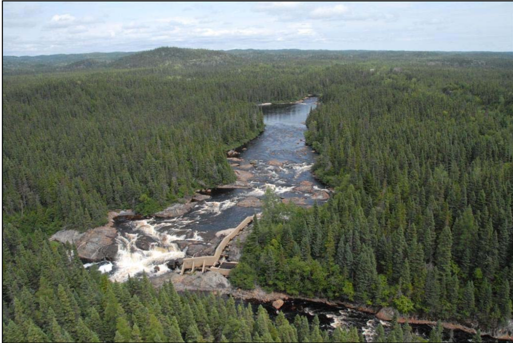
Salmon-pass on the rivière Matamec

The research institute ceased operations in 1984 due to a lack of funding. Nonetheless, some activities continued, including a monitoring program that had been set up in 1981 to measure the quality of water in Côte-Nord rivers, and a biological monitoring program dating from 1987 on how biological communities react to acid rain. Both of these programs were managed by Fisheries and Oceans Canada, and were closed down in 1996.