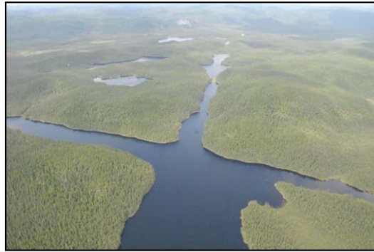
Lac La Croix

The greater part of the rivière Matamec flows over a rocky bed. Five major waterfalls characterize the upstream part of the river, where the vertical drop reaches 120 m approximately 6 km from the shoreline. The rivière-aux-Rats-Musqués empties into the Matamec at approximately 2 km from its mouth. The waters of the Matamec can be described as cold, soft freshwater, well oxygenated and low in minerals, and are typical of oligotrophic environments. The low level of mineralization means that these waters have a very limited buffering capacity.