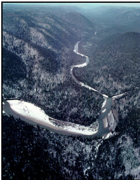
Figure 2. View of Grande Rivière from Trois-Fourches with the fork of Grande Rivière Nord on the right

Vegetation: The ecological reserve is largely forested. Balsam fir ( Abies balsamea ), white spruce, ( Picea glauca ), and white birch ( Betula papyrifera ) predominate on mesic sites, and eastern white cedar ( Thuja occidentalis ) on slopes. At lower altitudes, the plateaus are covered by white birch and red maple ( Acer rubrum ) stands; while sugar maple ( Acer saccharum ) and yellow birch ( Betula alleghaniensis ) dominate the sunnier slopes. Generally speaking, these stands are old and have been little or not at all affected by human activity or natural disturbances.