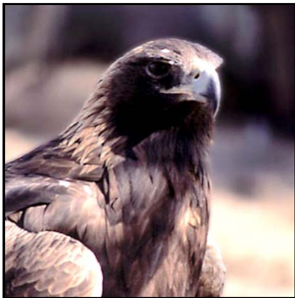
Figure 8. Golden Eagle ( Aquila chrysaetos )

The ecological reserve is also home to the Golden Eagle ( Aquila chrysaetos ), a diurnal bird of prey that is rare in the Gaspésie and vulnerable in Québec. It nests on the rocky cliffs overlooking the Grande Rivière (Figure 8). The last sighting dates back to 2003. The main threats to the golden eagle population are habitat loss, disturbance, and mortality due to human activity.