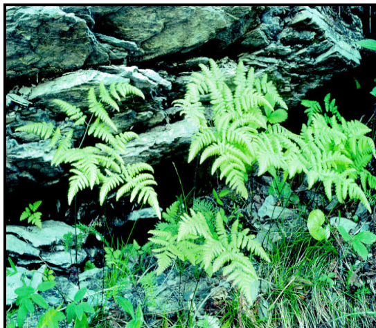
Figure 6. Limestone Fern ( Gymnocarpium robertianum )