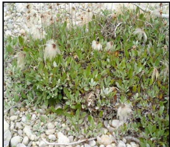
Figure 7. Yellow Mountain Avens ( Dryas drummondii )