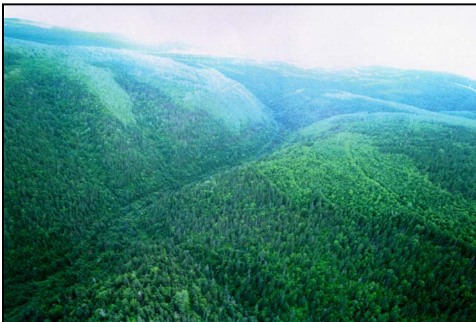
Photo 6. View of Grande Rivière, west of Coulée de la Montagne Blanche