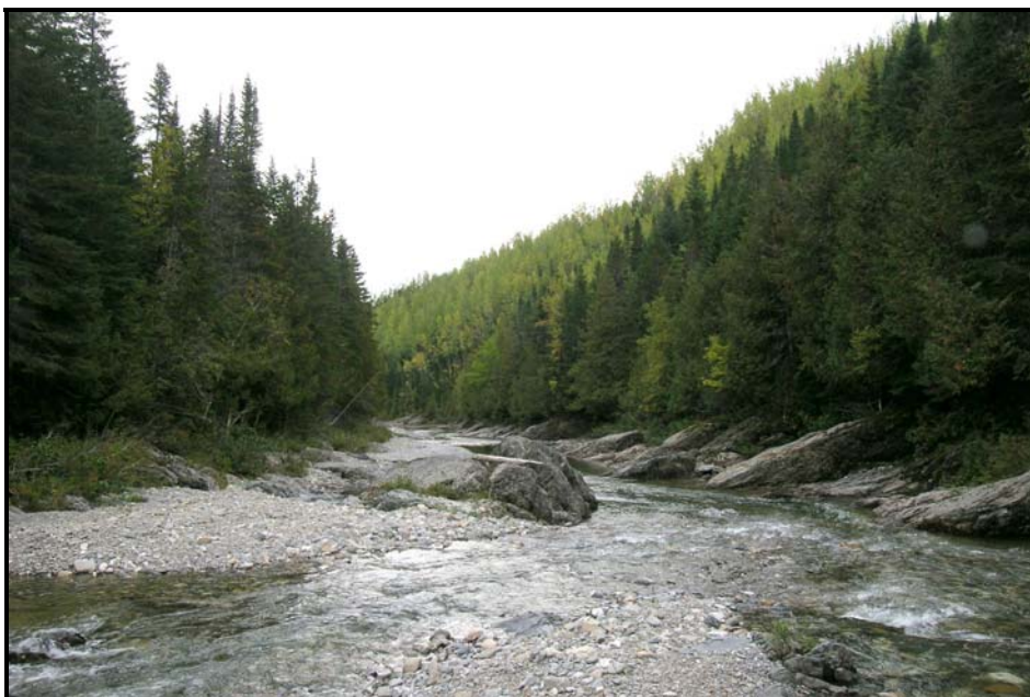
Photo 2. View of Grande Rivière Est