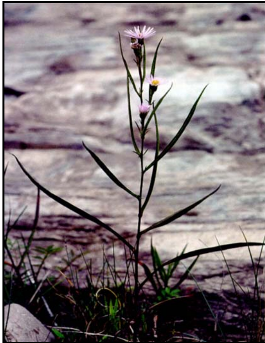
Figure 4. Anticosti Aster ( Symphyotrichum anticostense )