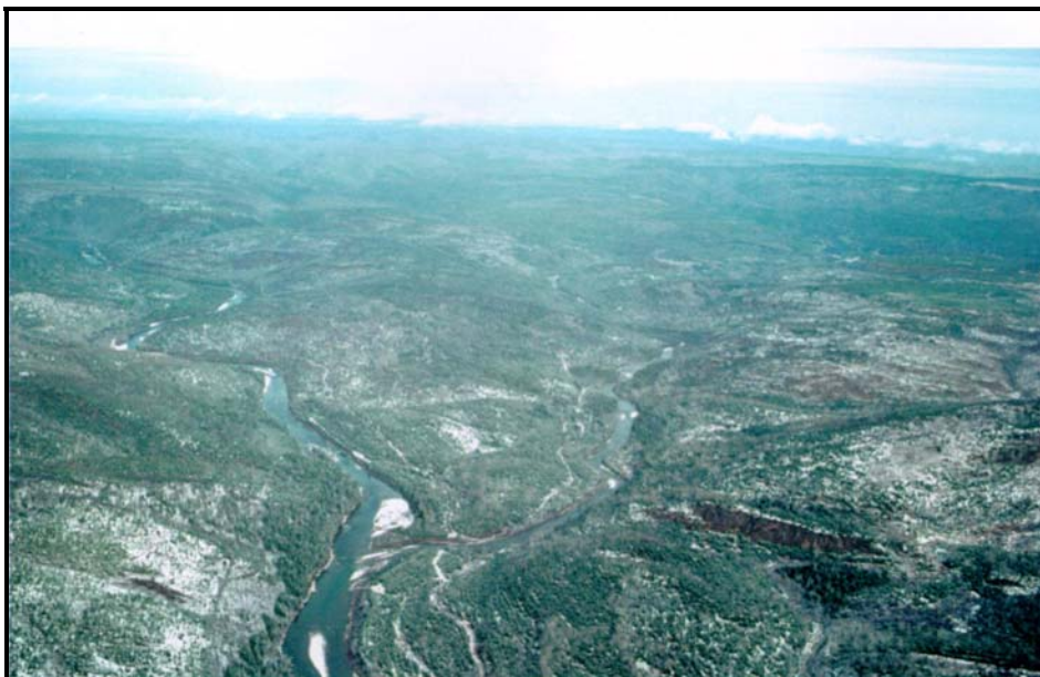
Photo 1. View of Grande Rivière and the fork of Grande Rivière Est