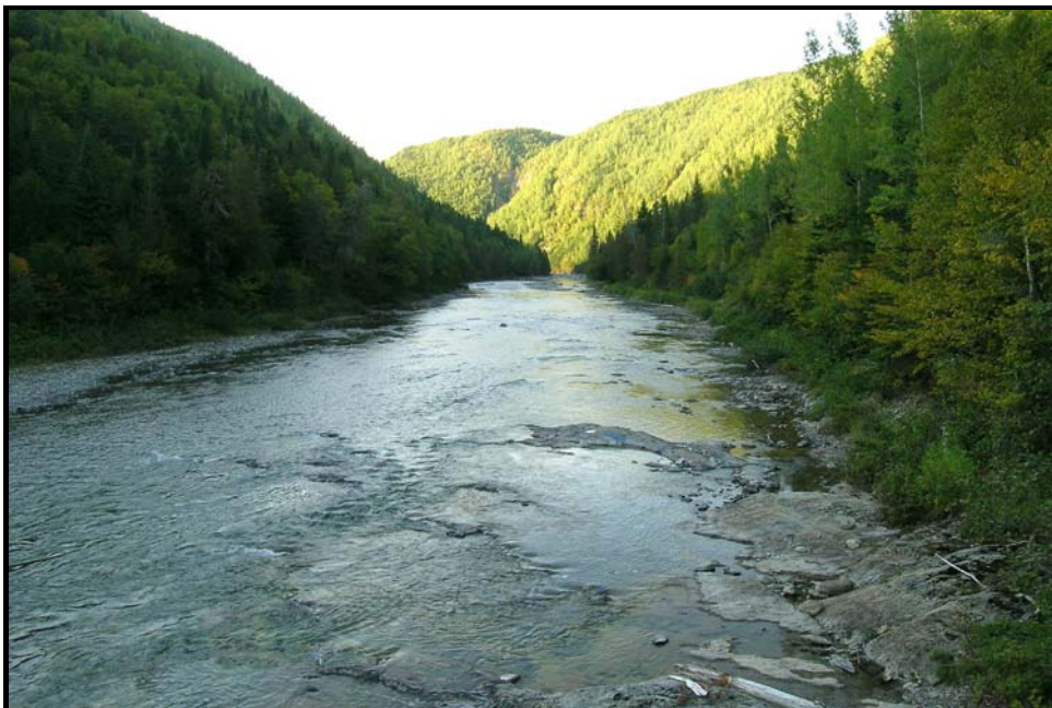
Photo 4. View of Grande Rivière in the Île des Mélèzes area, west of the fork of Grande Rivière Est