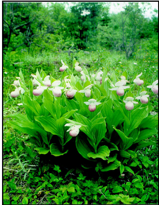
Figure 5. Showy Lady's Slipper ( Cypripedium reginae )