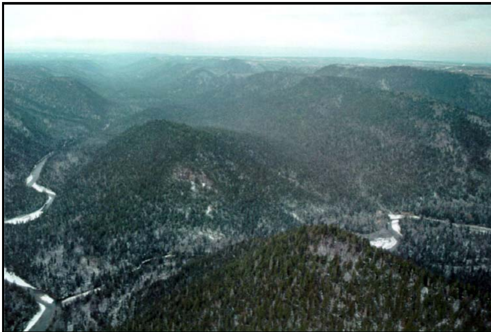
Photo 5. View of Grande Rivière Nord