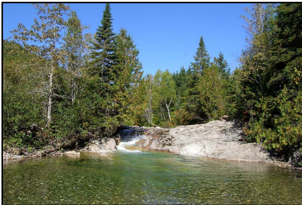
Figure 3. Grande Rivière Est with its limestone shores

In certain areas of the valley floor, there are eastern white cedar/balsam fir stands on peat, a unique forest ecosystem according to Ministère des Ressources naturelles et de la Faune. Sugar maple/yellow birch stands grow along Grande Rivière Est, the northern limit of their geographic range.