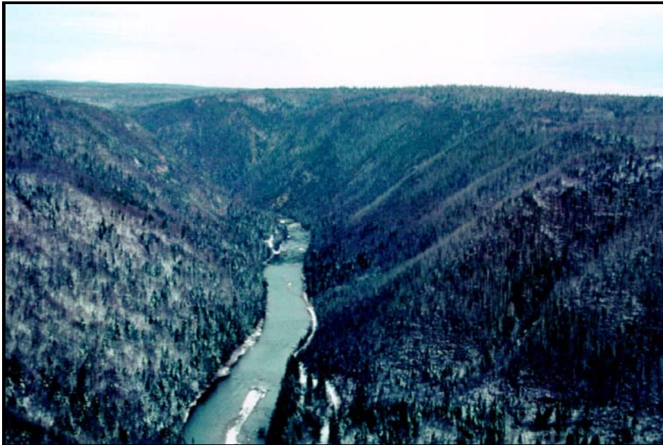
Photo 3. View of Grande Rivière, west of fork of Grande Rivière Est